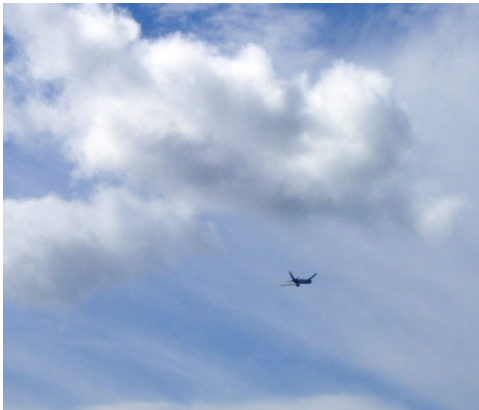
A plane coming over Cairns

On the 6 th of July 2008 I landed in Cairns airport and wasn't sure what to expect. I was in a new country, miles from home, surrounded by people I didn't know, but once I met the family I would be staying with for the next 2 months, they made me feel welcome and I knew I had no reason to be nervous.