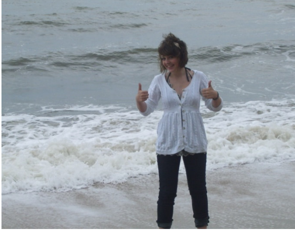
Me at Palm Cove

I learnt a lot while I was in Australia, not just in school but life lessons that have made me a more independent person and I've made many friends that I hope to meet up with later in life.