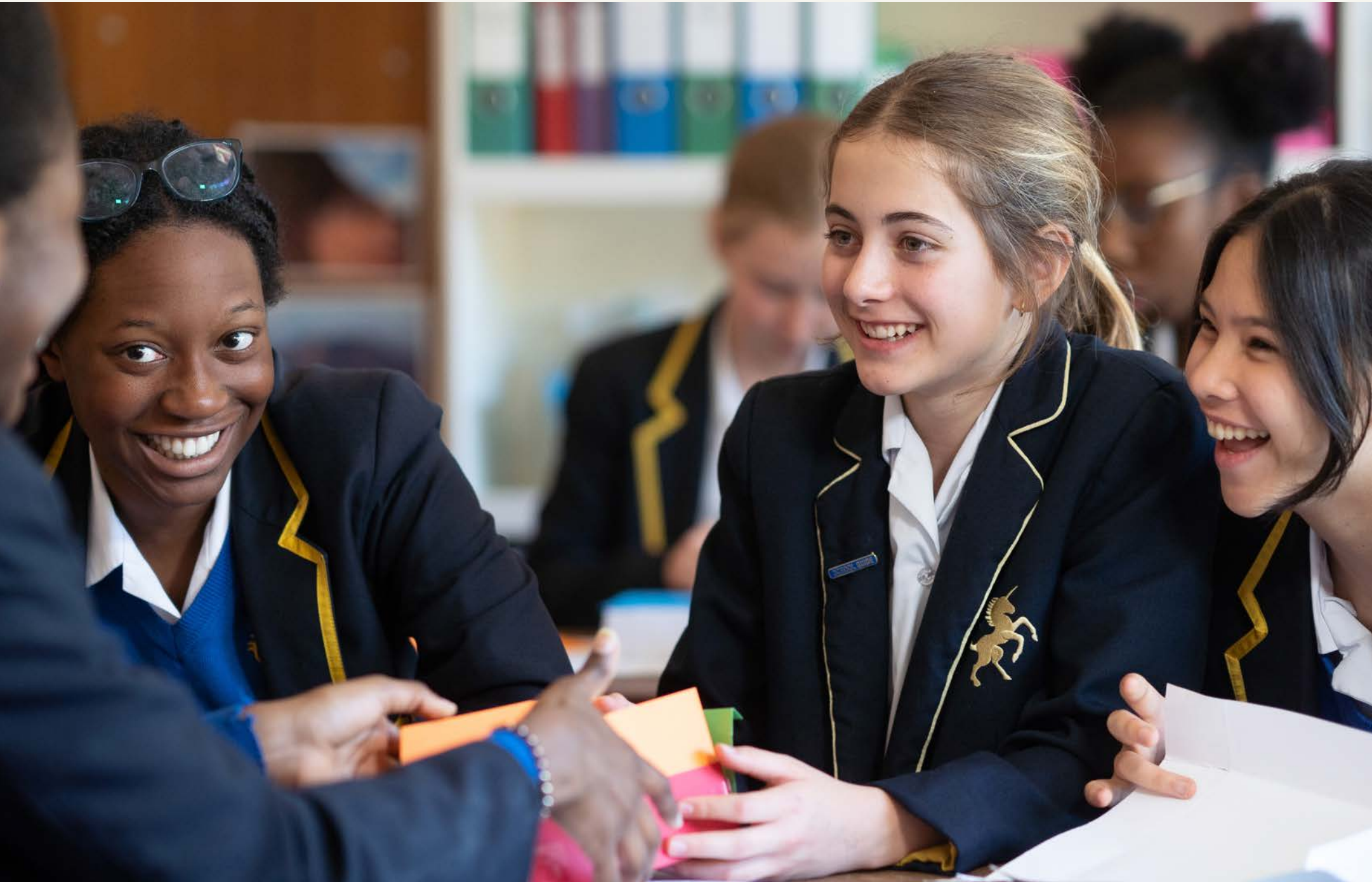
Carmen (Spain) - Year 8, one-year stay 2022-23