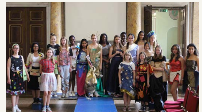
Recycled clothing fashion show