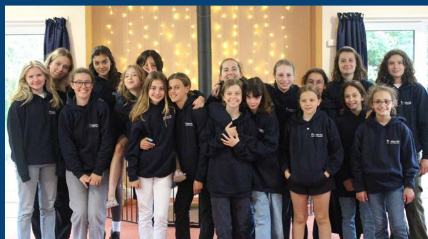
Summer Class 2023

Towards the end of the summer term, we offer an exciting and unique four-week immersive learning experience for students in any year group*.