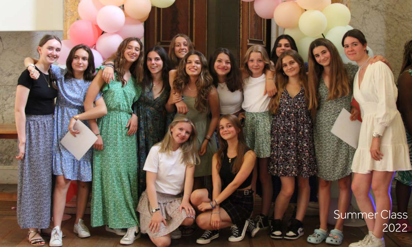
Summer Class 2022